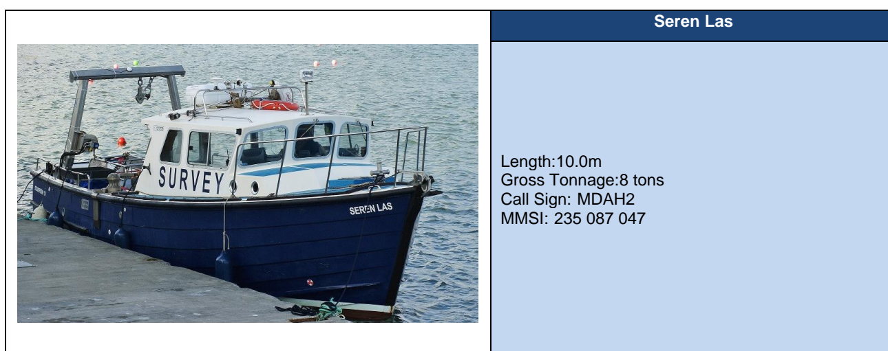
Table 3 Vessel details

Mariners are advised of the following vessels commencing operations at Sofia Offshore Wind Farm (SOWF).